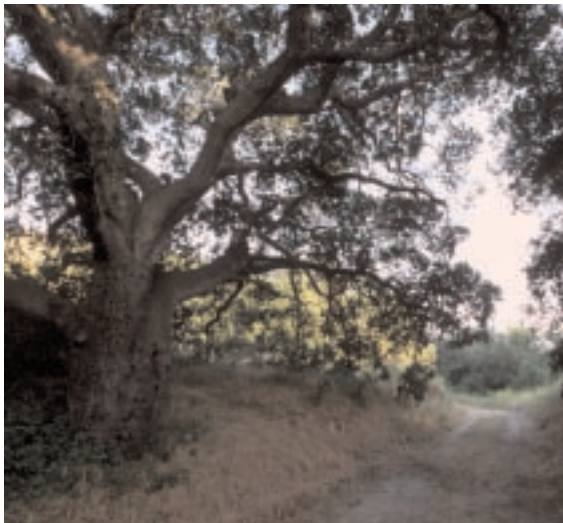
The Jeffrey Spine will lead to many places including Round Canyon

550 Newport Center Drive, Newport Beach, CA 92660 irvinecompany.com