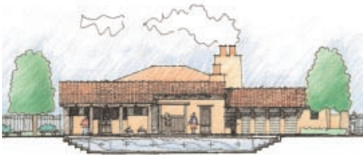
Neighborhood recreation center.

It is anticipated that model homes will open in Fall 2003. For more information on future homes, please visit the Homefinding Center at Irvine Spectrum, or visit www.irvineranch.com .